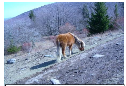
Wild Pony Herds!

The Philmont Crews are self contained – the older Scouts will form Patrols for this event.